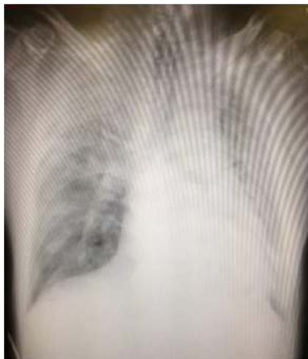
Legend: Chest radiograph showing bilateral infiltrate.