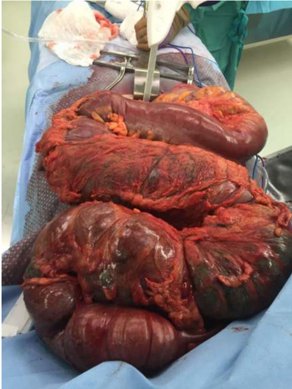
Figure 2. Complete colon resection showing diffuse and severe colon dilatation