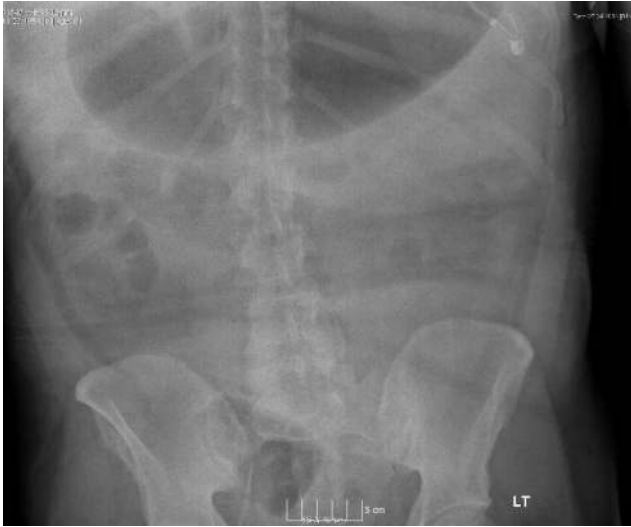
Figure 2. Initial abdominal X-ray demonstrating gastromegaly