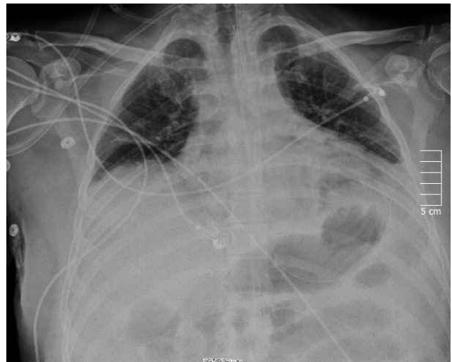
Figure 4. Follow-up chest X-ray following decompression with a nasogastric tube and continuous suction