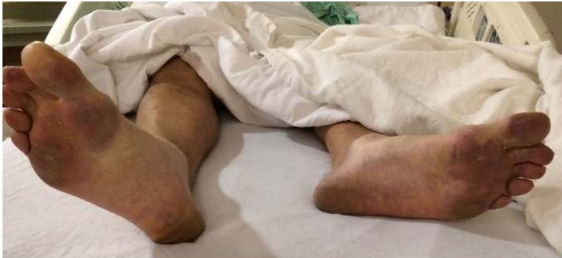
Figure 1. Cyanosis noted on both feet of the patient on arrival to the hospital

Legend: WBC=white blood cell count; ALP=alkaline phosphatase; ALT=alanine aminotransferase; AST=aspartate aminotransferase; Bilit=total bilirubin; BUN=blood urea nitrogen; CR-S=serum creatinine; CK=creatinine kinase; PCT=procalcitonin.