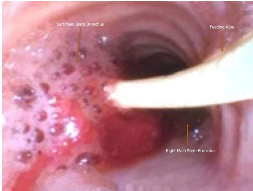
Figure 3. Bedside emergent bronchoscopy showing carinal rings, left/right main stem bronchus (solid arrow/label), and demonstrating the yellow small bowel feeding tube (solid arrow/label) malpositioned in the left mainstem bronchus