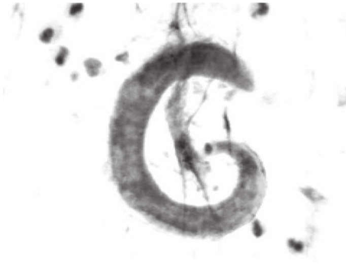
Figure 3. BAL revealing Strongyloides larvae and polymorphonuclear neutrophils