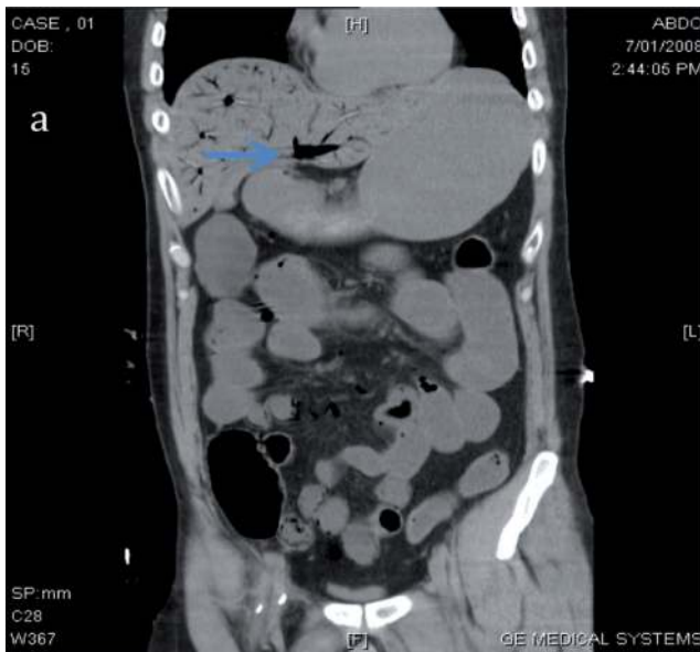
Figures 1a and 1b. CT scan of the abdomen, coronal view (left) and axial view (right) respectively, showing extensive gas throughout the portal venous system involving left lobe of liver and non-dependent portions of the right lobe of liver.

None of the authors has commercial association or financial involvement that might pose a conflict of interest in connection with this article.