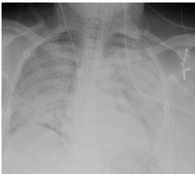
Figure 1. Case 1. Portable postero-anterior (PA) chest radiograph on admission to the ICU and 48 hours later.